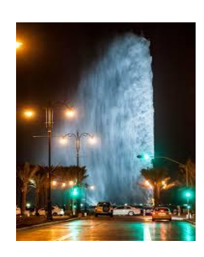
Jeddahs King Fahd Fountain