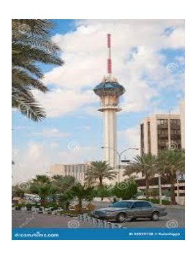
Riyadh TV Tower