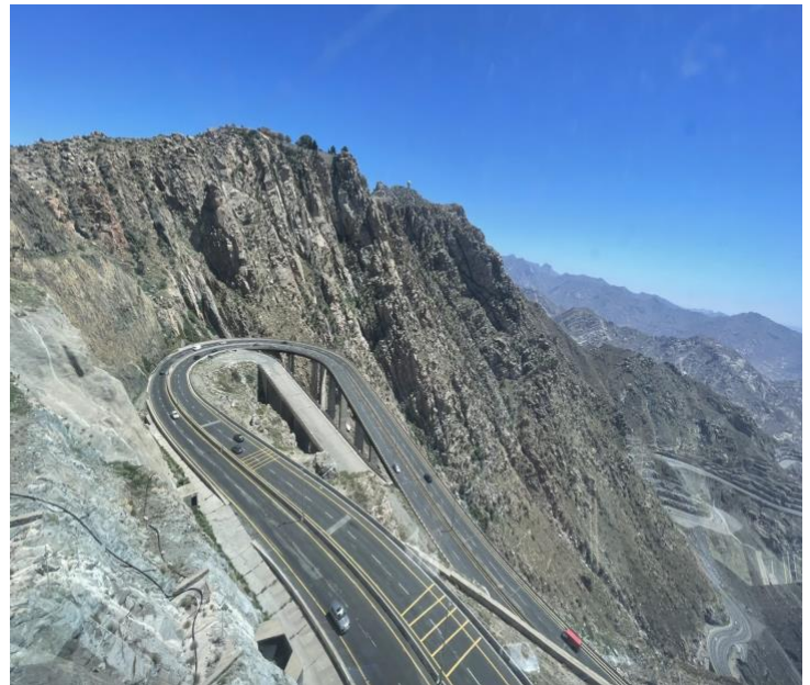
Winding roads to Taif