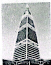
4. Faisaliyah tower, Riyadh