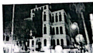
3. Naseef House