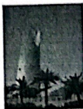
5. Kingdom tower, Riyadh